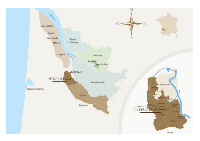
Exhibit 2: Appellations of the Bordeaux Region

Source: Ouvrard S. & Taplin I. M. (2018). Trading in fine wine: Institutionalized efficiency in the Place de Bordeaux system. Global Business and Organizational Excellence , 37:14–20. https://doi.org/10.1002/joe.21872